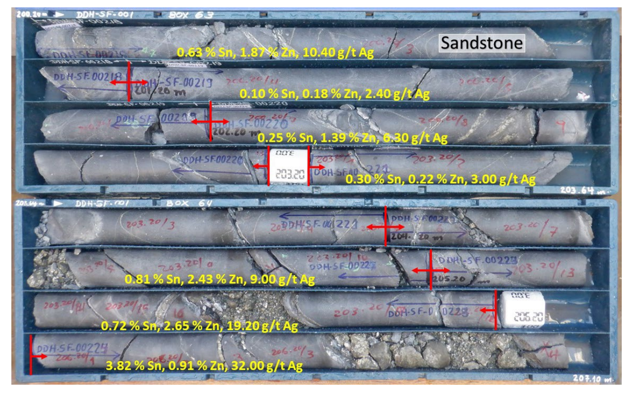
Figure 2. Polymetallic mineralization in core hole DDH-SF-001, from 200.20 m to 207.10 m.